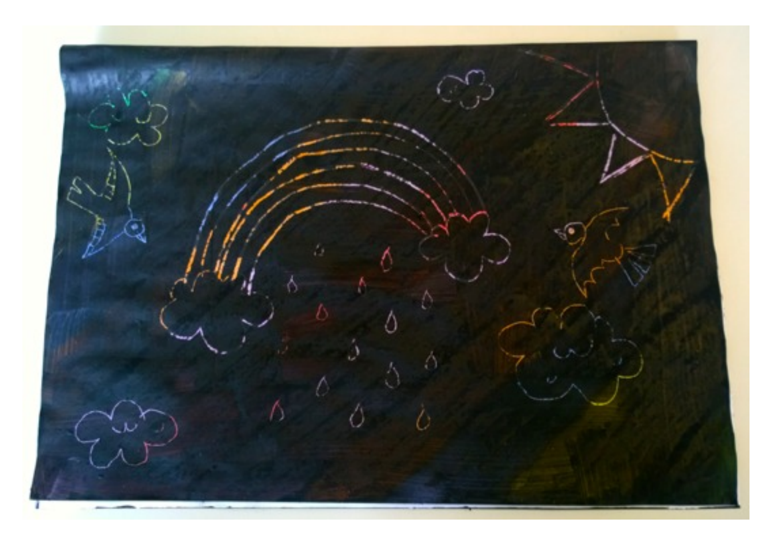
Plus another we have made to give you inspiration!

And there you have it your very own Rainbow Scratch Painting!